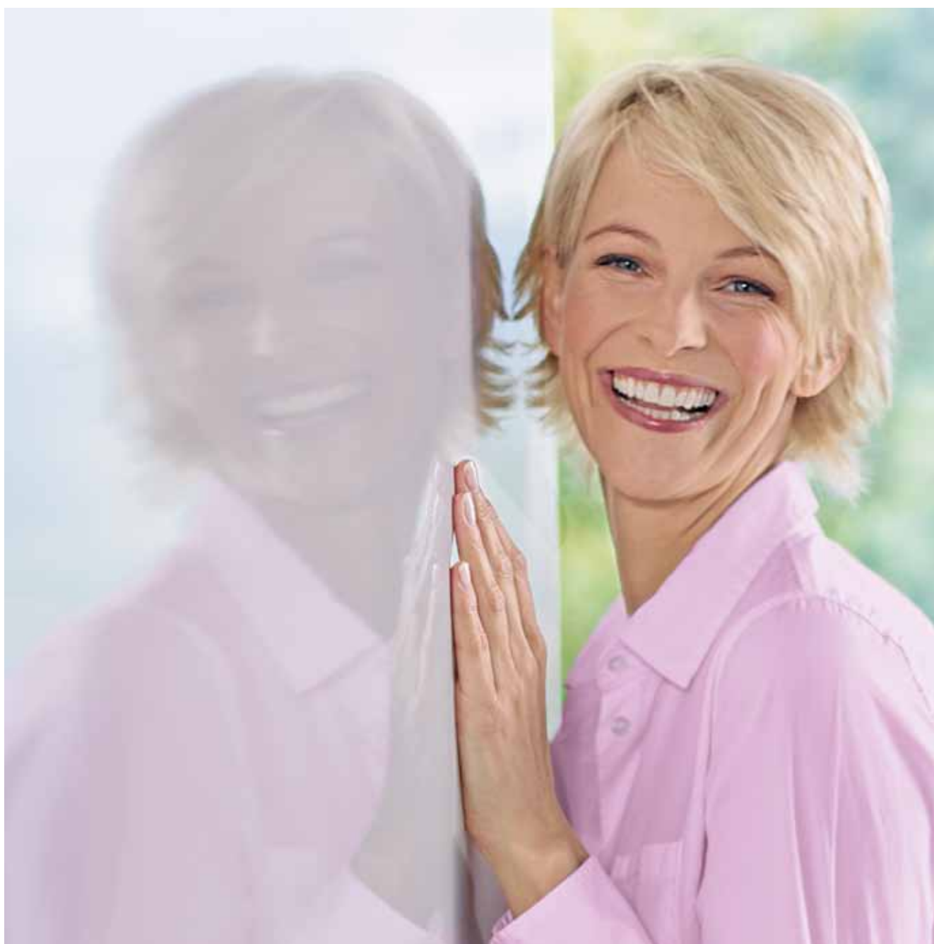
HG High gloss