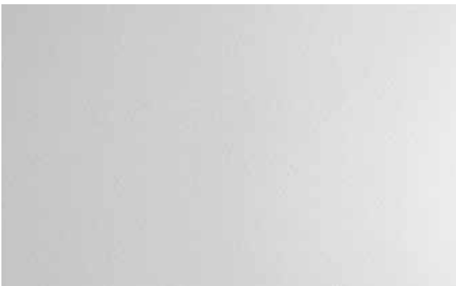
WV Top Velvet