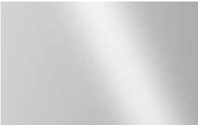
HG High gloss