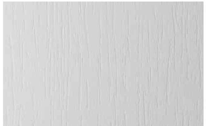
NH Natural wood pore