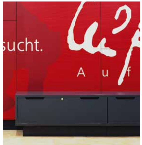
Grammar school, Grünwald