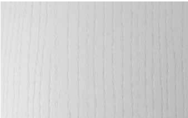
AH wood pore